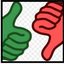
Agree to Disagree?